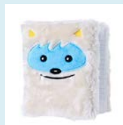
Yeti Fluffy Notebook

Exciting new Term 2 Polar Savers rewards are now available, while stocks last!