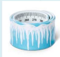
Icicle slap band Ruler

The Scented Stackable Highlighters and Snowy Origami Set from term 1 are also still available.