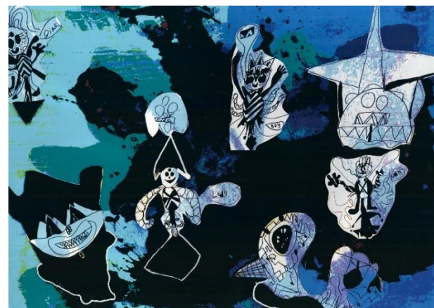
Paxton M - 2J

https://digital.artsunit.nsw.edu.au/visual-arts/operation-art/2019/lessons