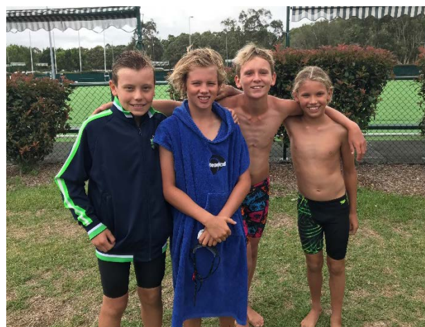
Senior Boys Relay Team