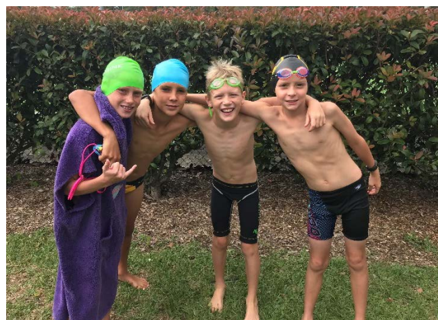
Junior Boys Relay Team